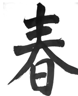
Chun / Spring