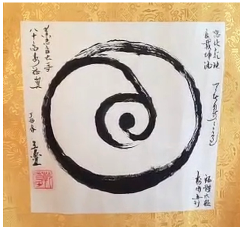
Calligraphy by Master Wu