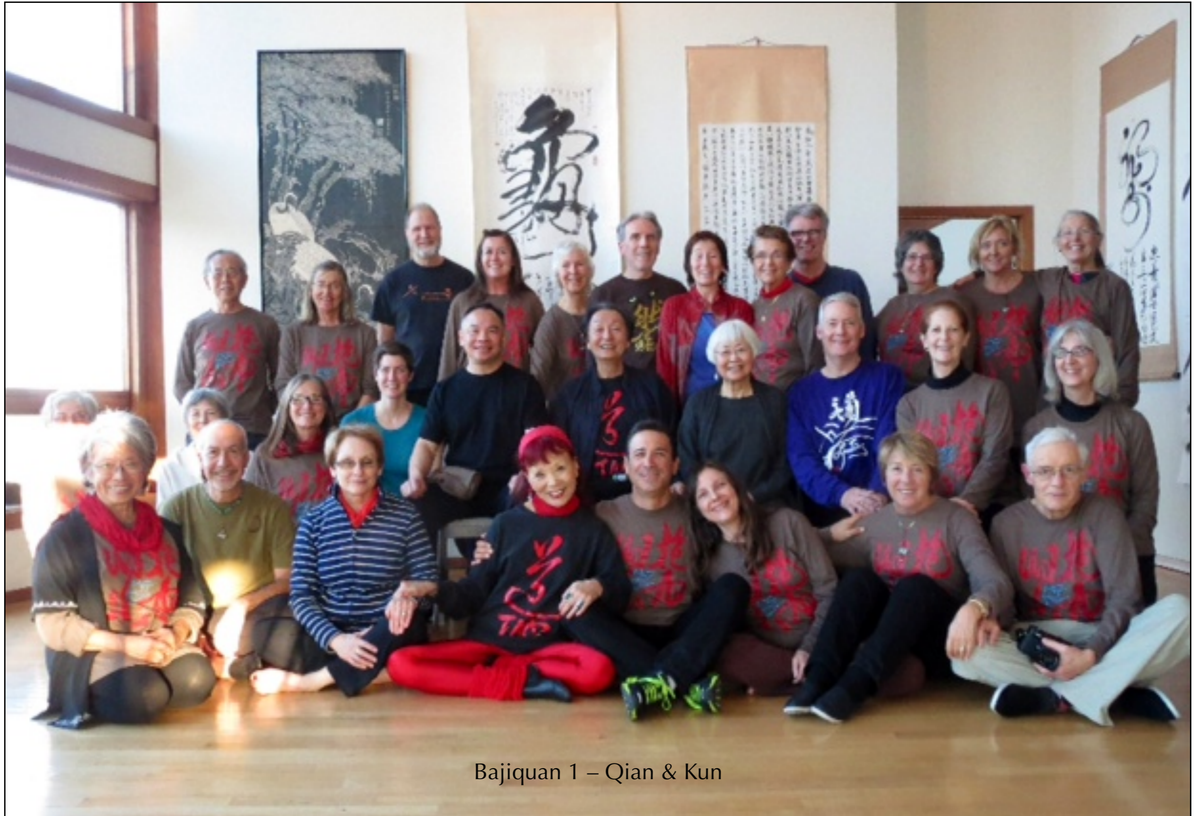
Bajiquan 1 – Qian & Kun