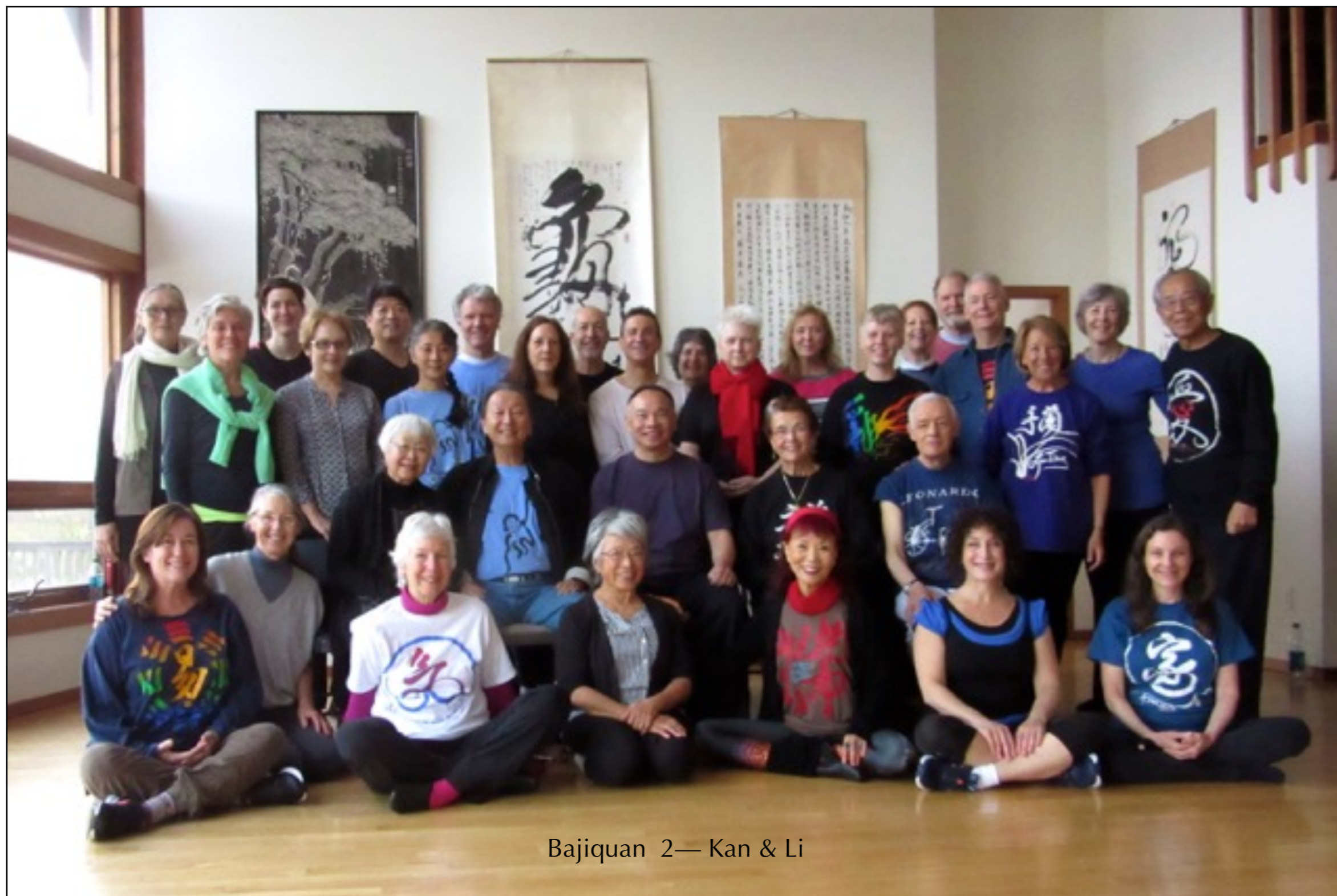
Bajiquan 2— Kan & Li