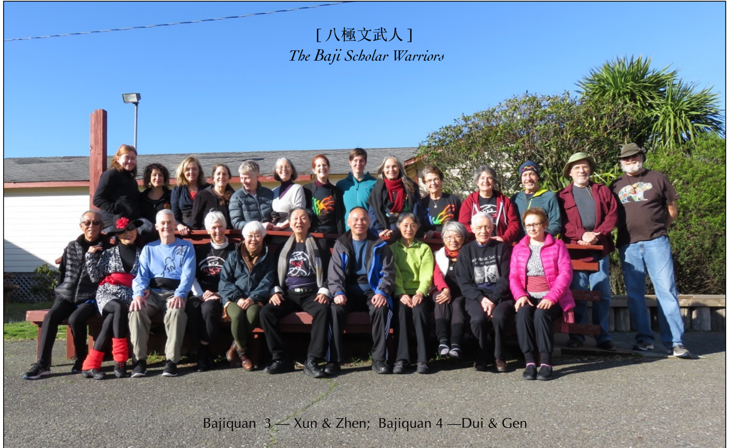
Bajiquan 3 — Xun & Zhen; Bajiquan 4 — Dui & Gen