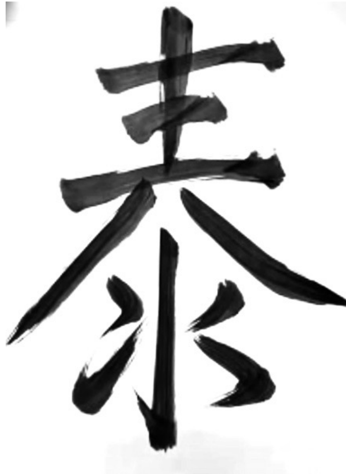
Tai – Peace