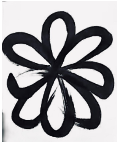
Golden Flower – Jing Hua