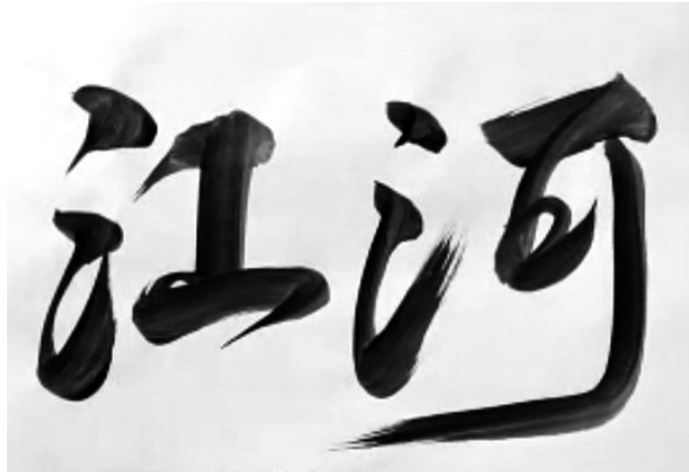
Jiang He Shui – River Water Flowing