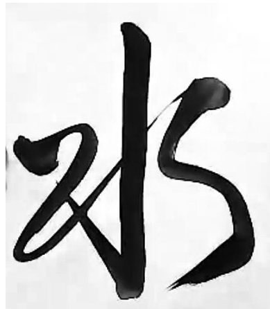
Shui – Water