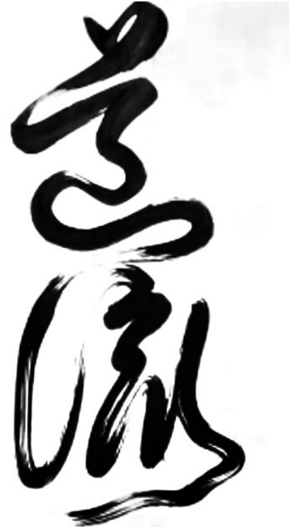
Dao Liu Flowing Dao