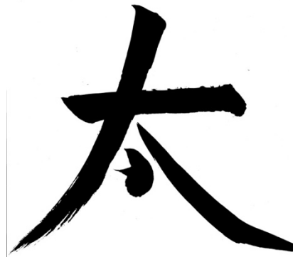
Tai – Great