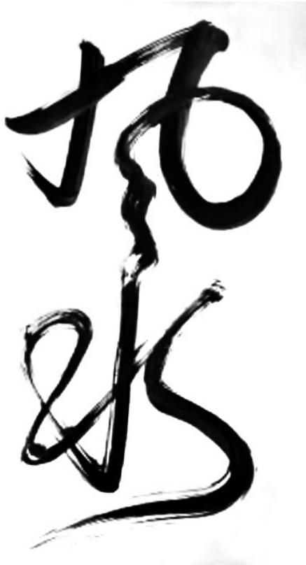
Feng Shui Wind Water