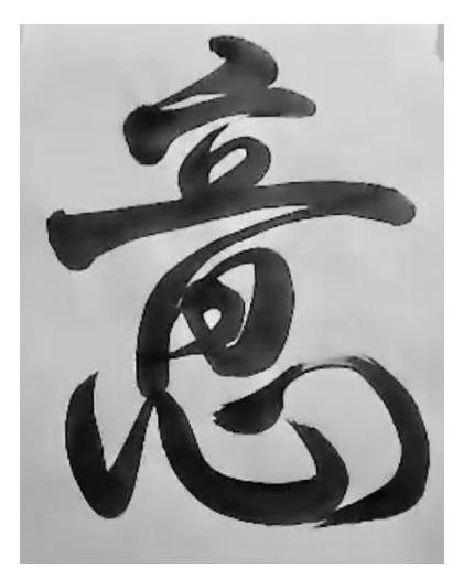
Yì (idea, meaning – music of the heart)