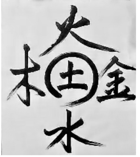
Wu Xing – 5 Moving Forces: Huŏ - fire, Shuǐ - water, Mù – wood, Jīn - metal/gold, Tǔ - earth*