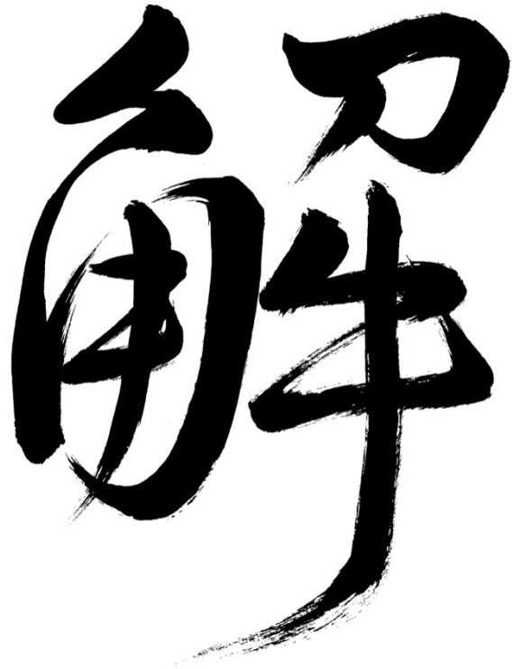
Hexagram #40 Symbol Jiě (deliverance, “untying”, understanding)

Reference: I Ching: The Classic Chinese Oracle of Change*