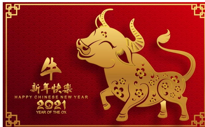
2021 The year of the Golden Ox 金牛