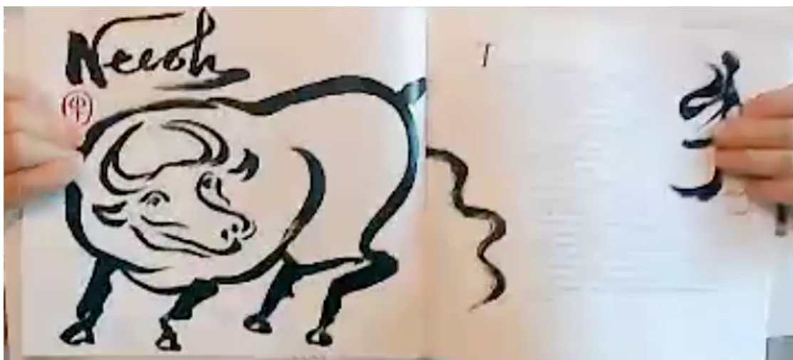
Reference: "The Chinese Book of Animal Powers"*