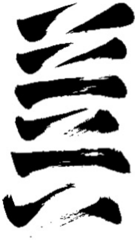
Hexagram #40 Thunder/arousing (Zhen) above Water/abyss (Kan) below