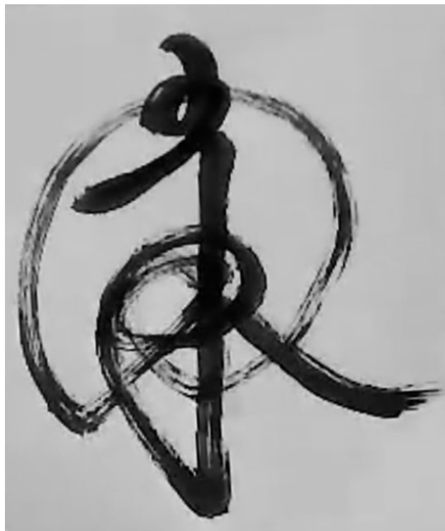
Yǒng – cursive