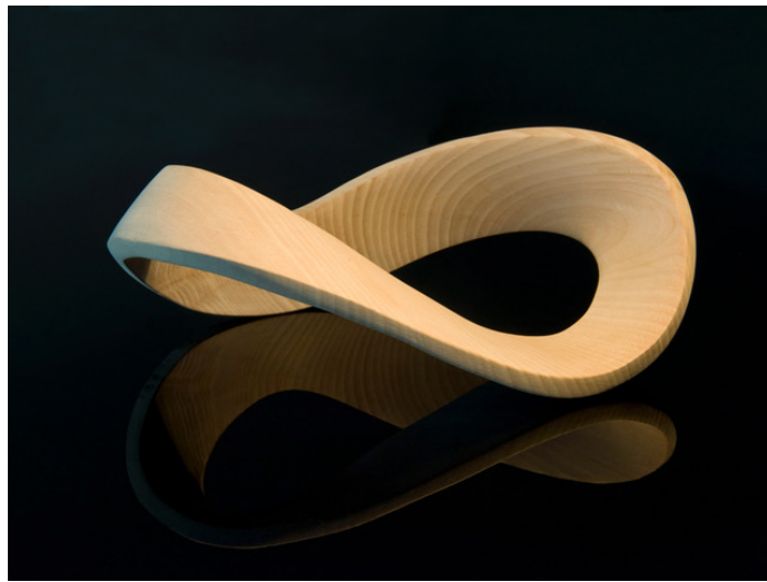
Mobius Strip carving by Pius Brogle

The beginning of each Living Tao circle form: Infinity/Mobius Strip action based on the traditional Lan Que Wei = Grasping Swallows Tail