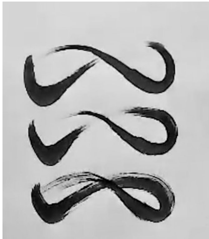
Infinity: Brush and Ink

The next movement series following the beginning: